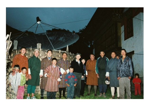
Rukubuji villagers and the parabolic antenna