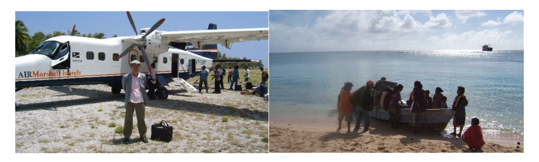
Air Marshall flies once a week between Mejit and Majuro. Cargo ship comes once a one or two