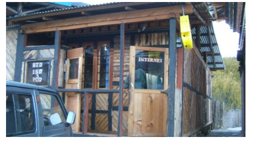
Internet kiosk in rural area of Bhutan