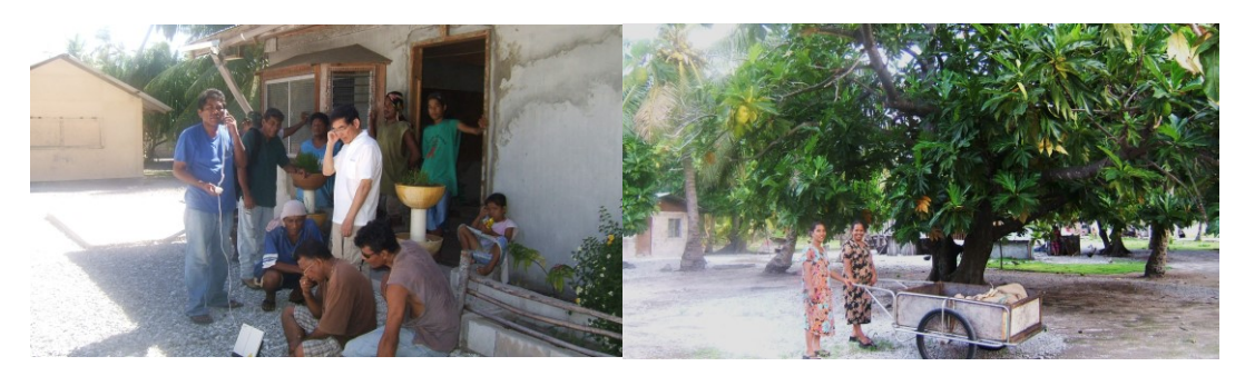
Mejit islanders using Inmarsat BGan satellite terminal. Mejit women islanders.

RMI is Small Island Developing State consisting of 29 atolls and 5 islands. Mejit island is one of 5 islands isolated by about 400 km from its capital of Majuro on the main atoll. Population is 420 individuals and 85 families. Inhabitants rely on riches of the surrounding ocean and a few fruit bearing trees on the island. At that time only telecommunication system was short wave radio via an operator to the capital for commercial and personal communication. The project was funded by the APT to introduce satellite connectivity deploying VSAT and low power and compact femto-cell base station. With the C-band geostationary (GEO) satellite connection via Marshall Island National Authority (MINTA) and femto-cell base station, islanders may benefit for use of cellular phone and other telecommunication services such as e-health consultation with the hospital of Majuro at the health post of the island, and elearning at the school and e-government service through the tele-center. Electricity is supplied only by solar power and windmill power together with lead-acid battery. After completion of the system in October, 2011, the system was transferred to national telecom authority (MINTA). The ITU Association of Japan, KDDI and KDDI foundation provided expertise and consultation. Optic fiber fusion splicing machine and its technical training workshop was provided at the later phase by the APT funded project.